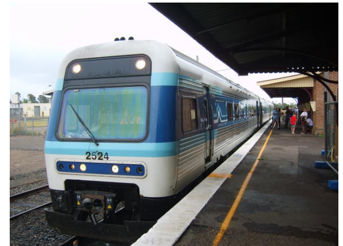
Xplorer at Moree 28.12.2008

Thursday 27 th December, 2018 to Tuesday 2 nd January, 2019